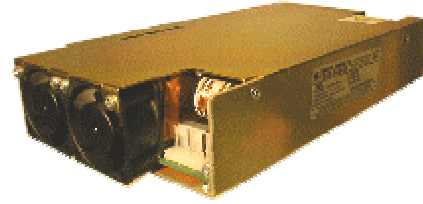
Low profile: 212.5 x 116 x 43mm